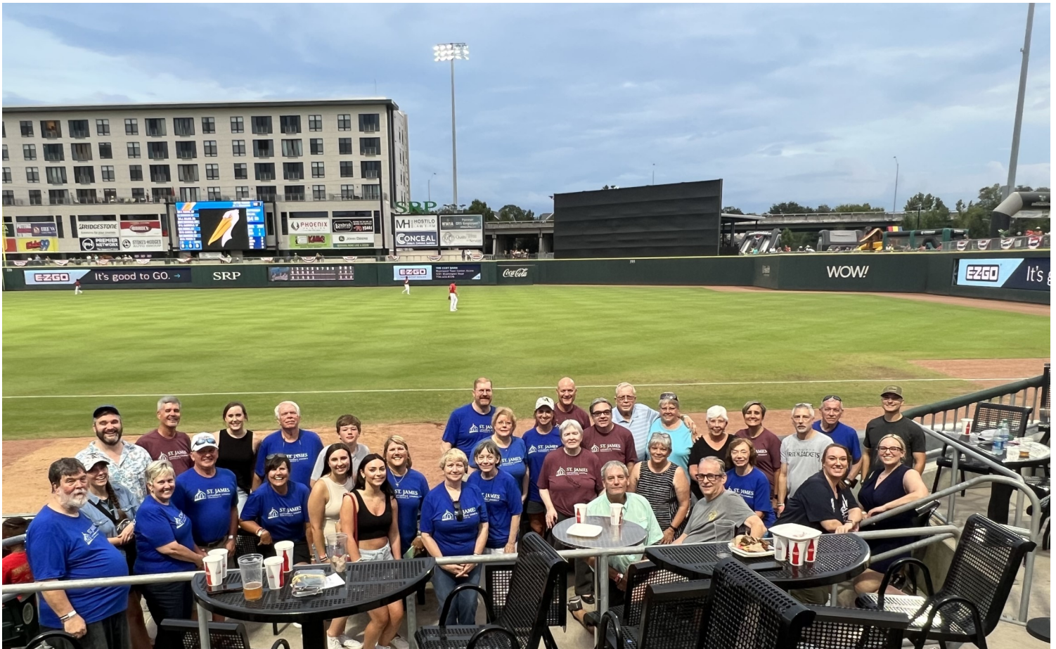
St. James Baseball Outing at the GreenJackets