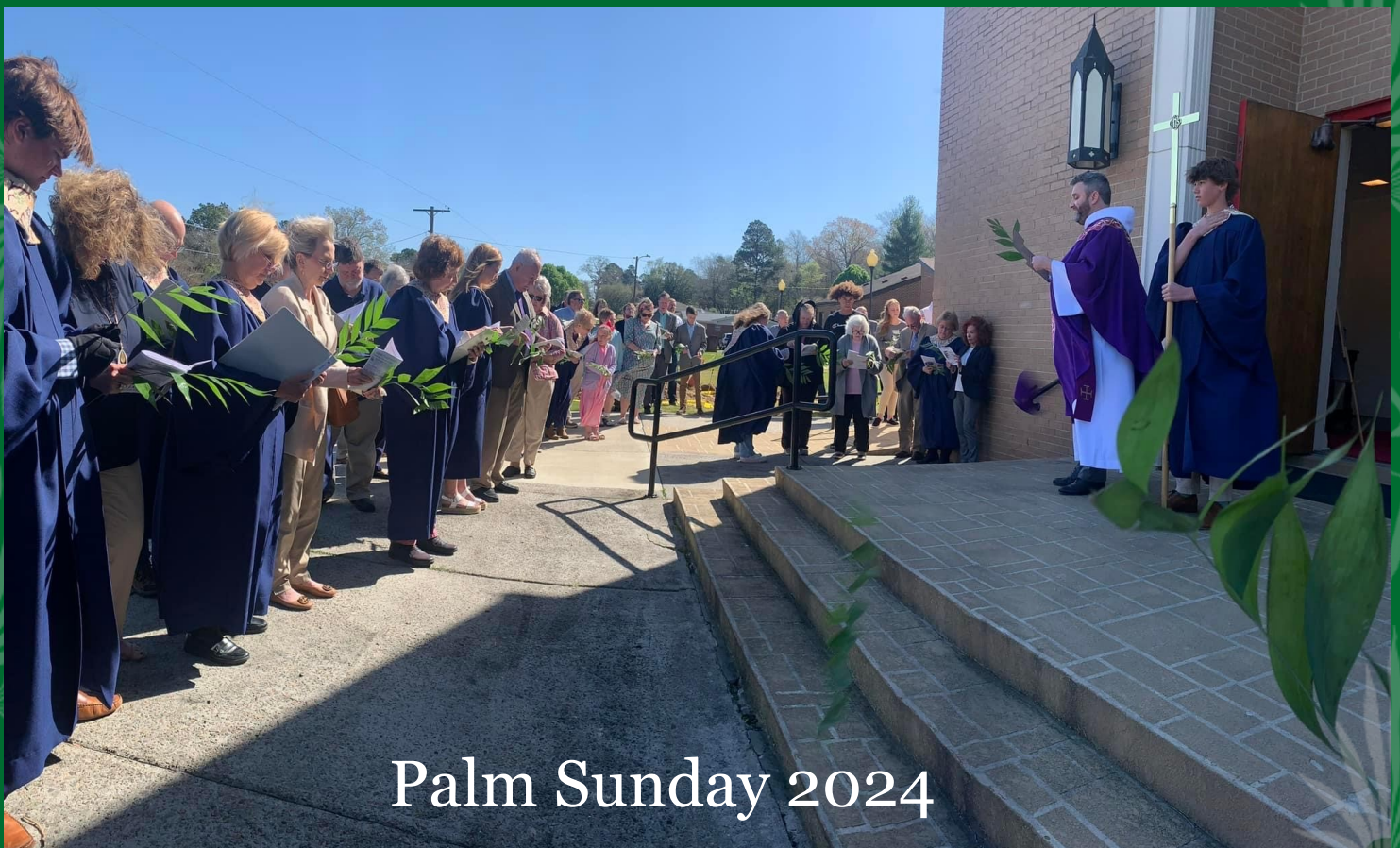
Palm Sunday 2024